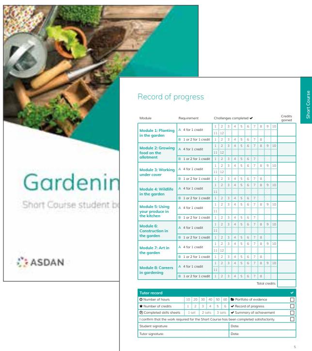
Gardening Short Course student book cover (left) and record of progress (right).

It is followed by the tutor/assessor record, which should be completed by the tutor at the end of the Short Course. This is the official checklist and signed confirmation that the co-ordinator has checked through the portfolio and approved it for certification.