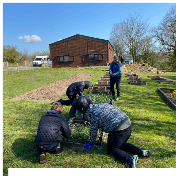
Gardening Short Course learners working on their allotment

“When students come to Coal Clough Academy, in their minds, they have had a poor experience of education. ASDAN’s Gardening Short Course has shown our students that they can really achieve. It’s rebuilt their self-esteem and shown them that they do have valuable skills.