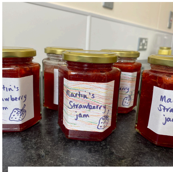
Strawberry jam made from fruit grown by the learners

“Our learners have made strawberry jam as part of the Module 5: Using your produce in the garden . Students aren’t just learning horticulture, they’re gaining knowledge about all stages of the production and manufacturing process,