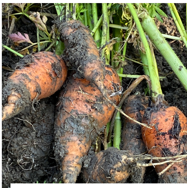
Carrots grown on the allotment by the learners