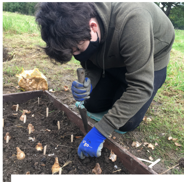
ASDAN learner planting daffodils

ASDAN's Gardening Short Course is a multi-level internally moderated award available as a student book or e-portfolio.